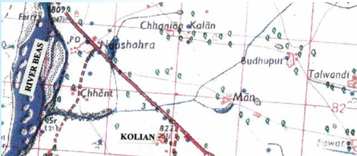
LOCATION OF KOLIAN IN TEHSIL DASUYA, DISTRICT HOSHIARPUR

Chaudhary Ali Akbar Khan was born on 28 September 1910 in Village Kolian, Muslim Rajputan, located on the eastern bank of Beas River, approximately five miles west of Mukerian, in Hoshiarpur District, East Punjab.