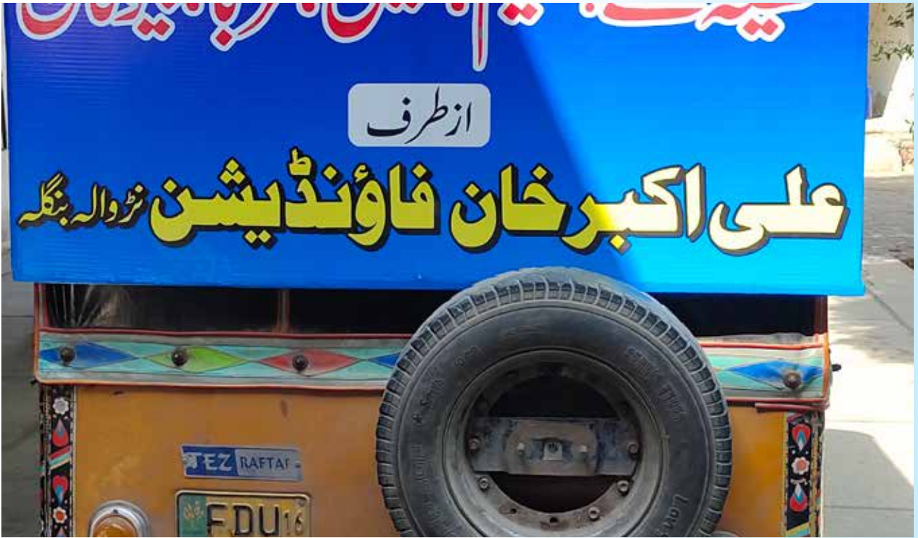
BILLBOARD ON VEHICLE UTILIZED FOR DISTRIBUTION OF RATIONS AND CLOTHING IN VILLAGES