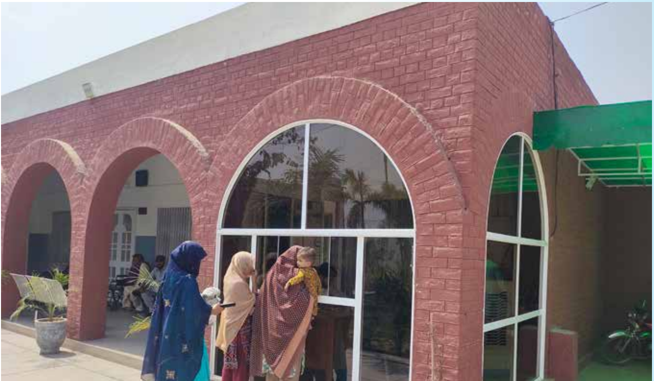
LADY PATIENTS BEING ISSUED WITH MEDICAL CHITS TO CONSULT THE DOCTOR