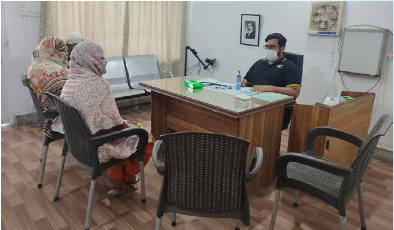
DOCTOR ATTENDING TO LADY PATIENTS