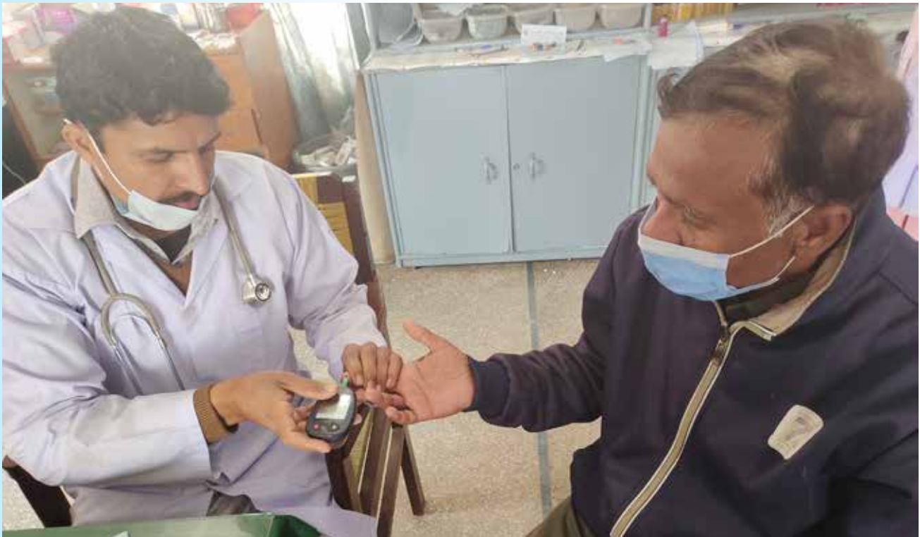
SUGAR TEST BEING CONDUCTED ON A PATIENT