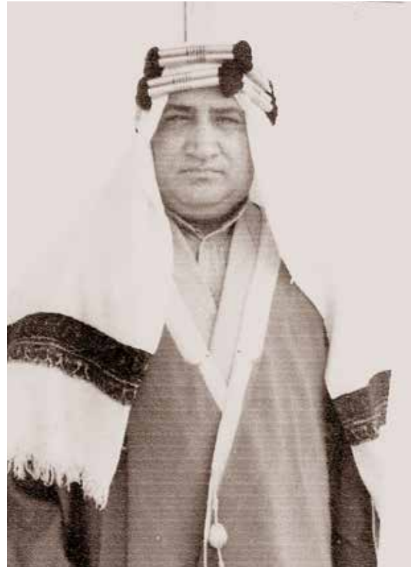
IN TRADITIONAL ARAB DRESS IN JEDDAH