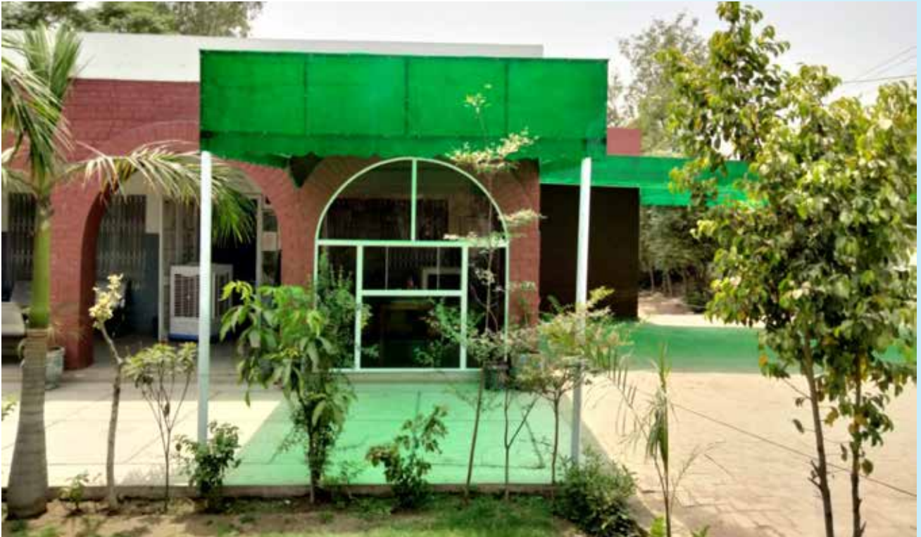
ANOTHER VIEW OF THE AAMC