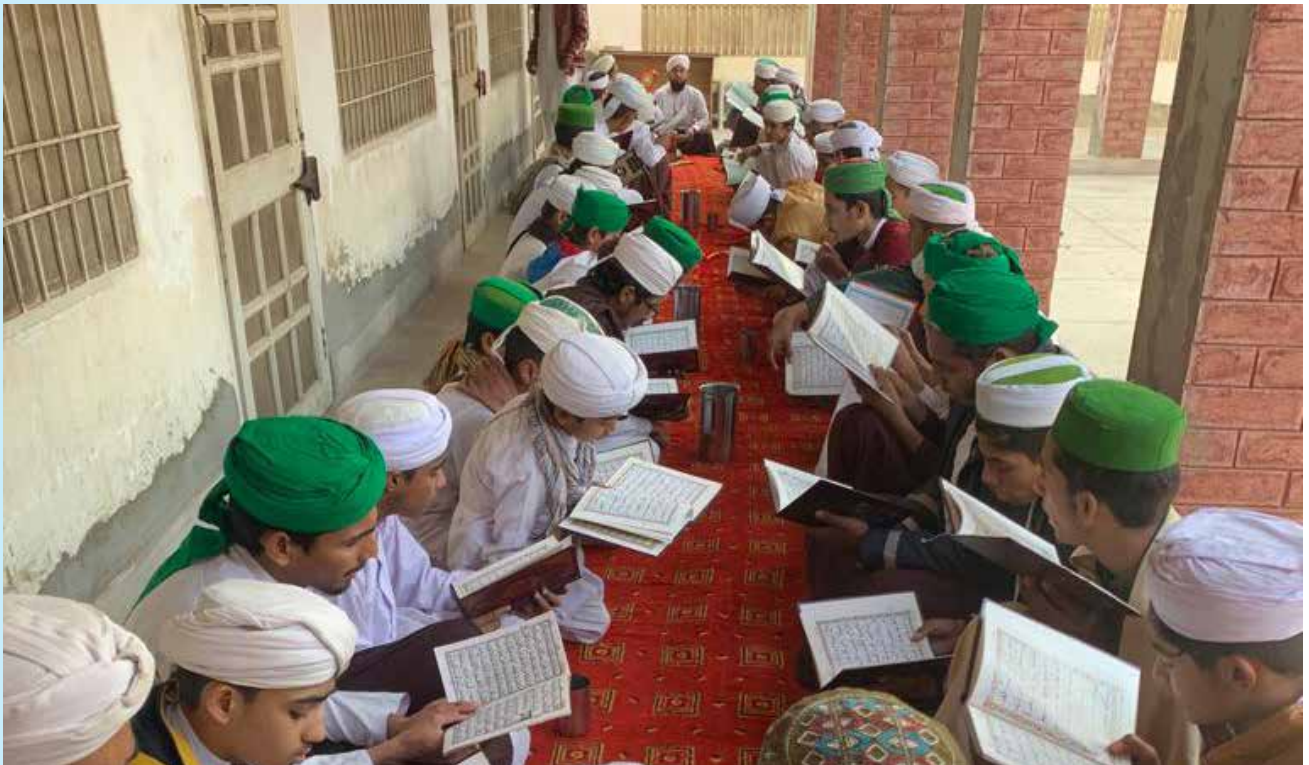
PERIODIC QURAN KHWANI AT THE AAMC