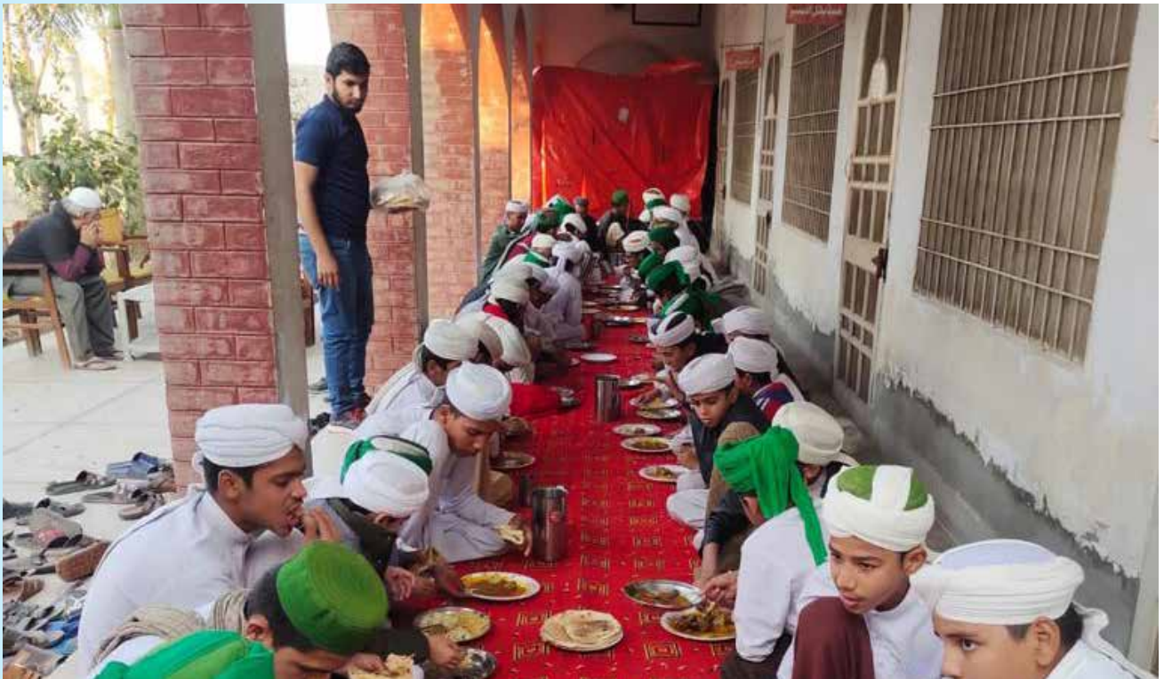
COOKED MEALS SERVED TO THE PEOPLE AFTER QURAN KHWANI