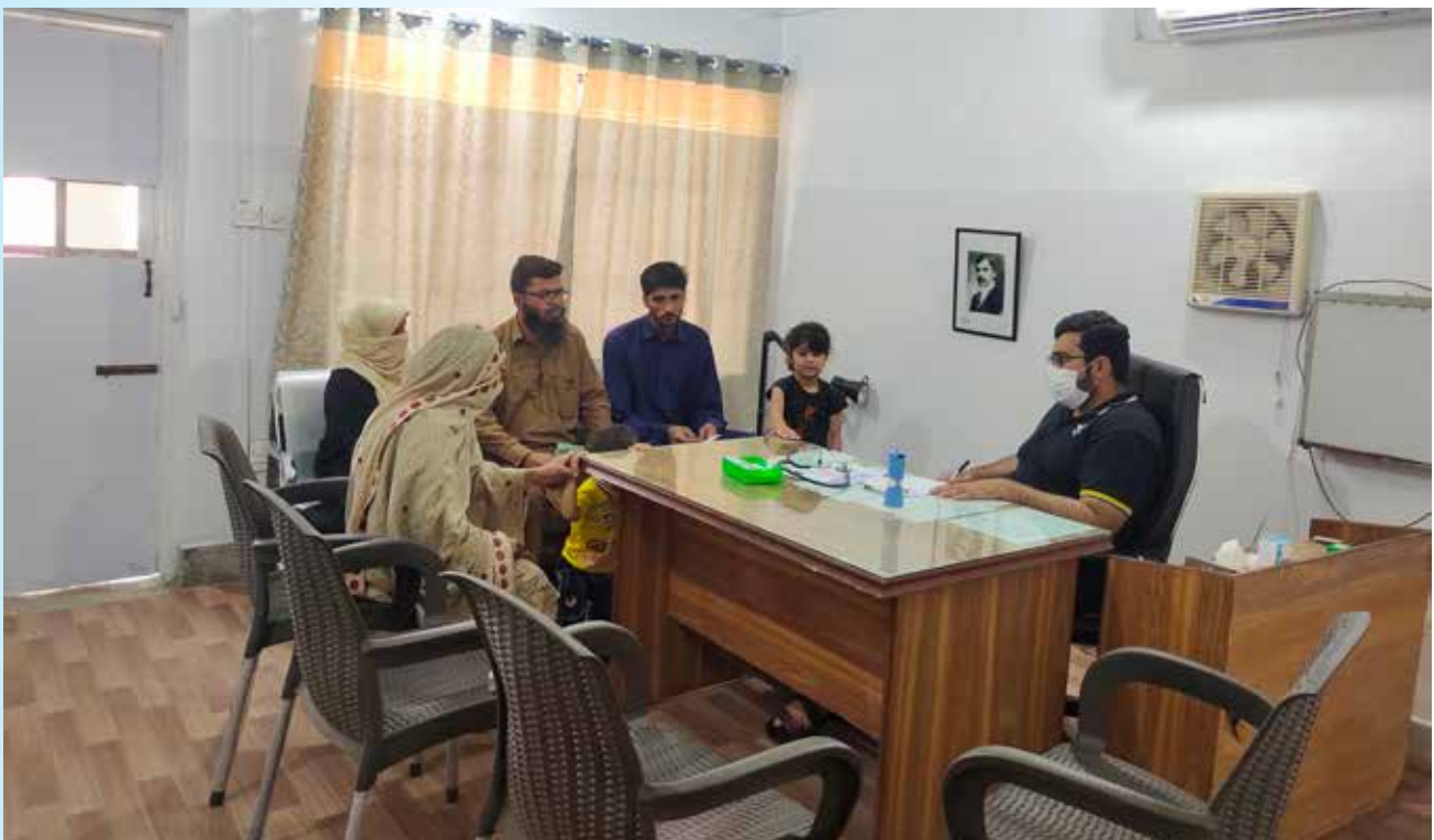
DOCTOR ATTENDING THE PATIENTS