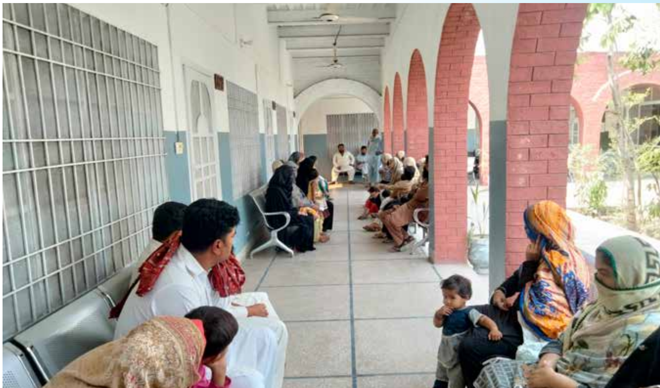
LADIES AND GENTS WAITING TO CONSULT THE DOCTOR AND TAKE MEDICINES