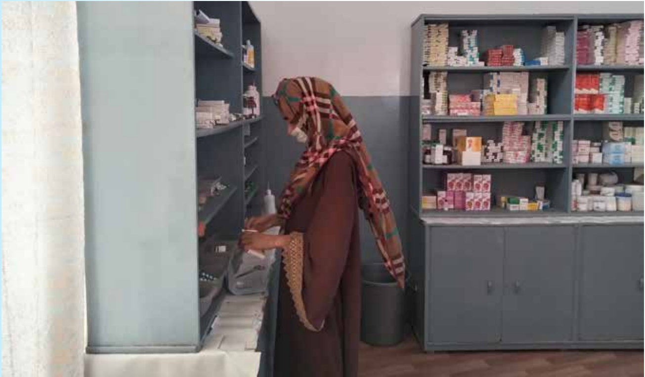
ARRANGING MEDICINES AT THE MEDICAL ROOM