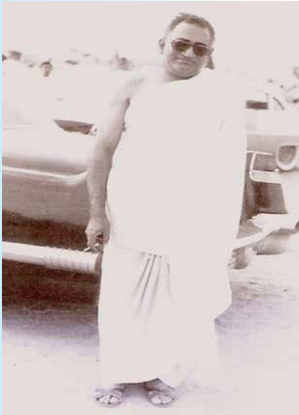
STANDING INFRONT OF HIS CAR DURING HAJJ