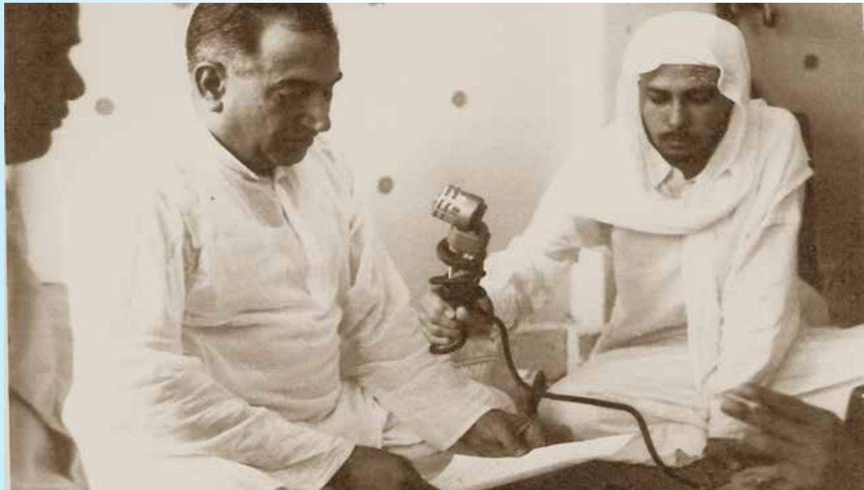
RECORDING MESSAGE ON RADIO OF JEDDAH ON REPUBLIC DAY OF PAKISTAN (23 MARCH 1961)

He contested and won the general elections for the National Assembly of Pakistan in 1964 from Samundri, Faisalabad District. He was inducted by Field Marshal Muhammad Ayub Khan, President of the Islamic Republic of Pakistan in his Federal Cabinet as Minister of Home & Kashmir Affairs. He remained as the Federal Minister from 1965 to 1966, which included the period of the 1965 India-Pakistan War.