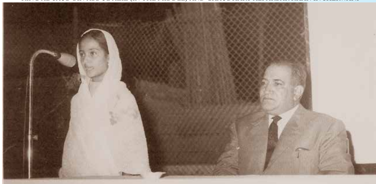
ON STAGE LISTENING TO SPEECH BEING MADE BY A STUDENT OF EMBASSY OF PAKISTAN SCHOOL IN JEDDAH DURING THE PAKISTAN INDEPENDENCE DAY FUNCTION (14 AUGUST 1960)