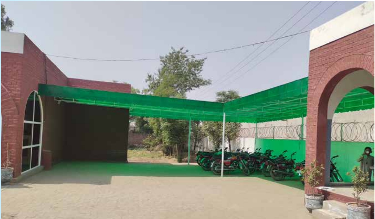
ENTRANCE VIEW OF THE AAMC