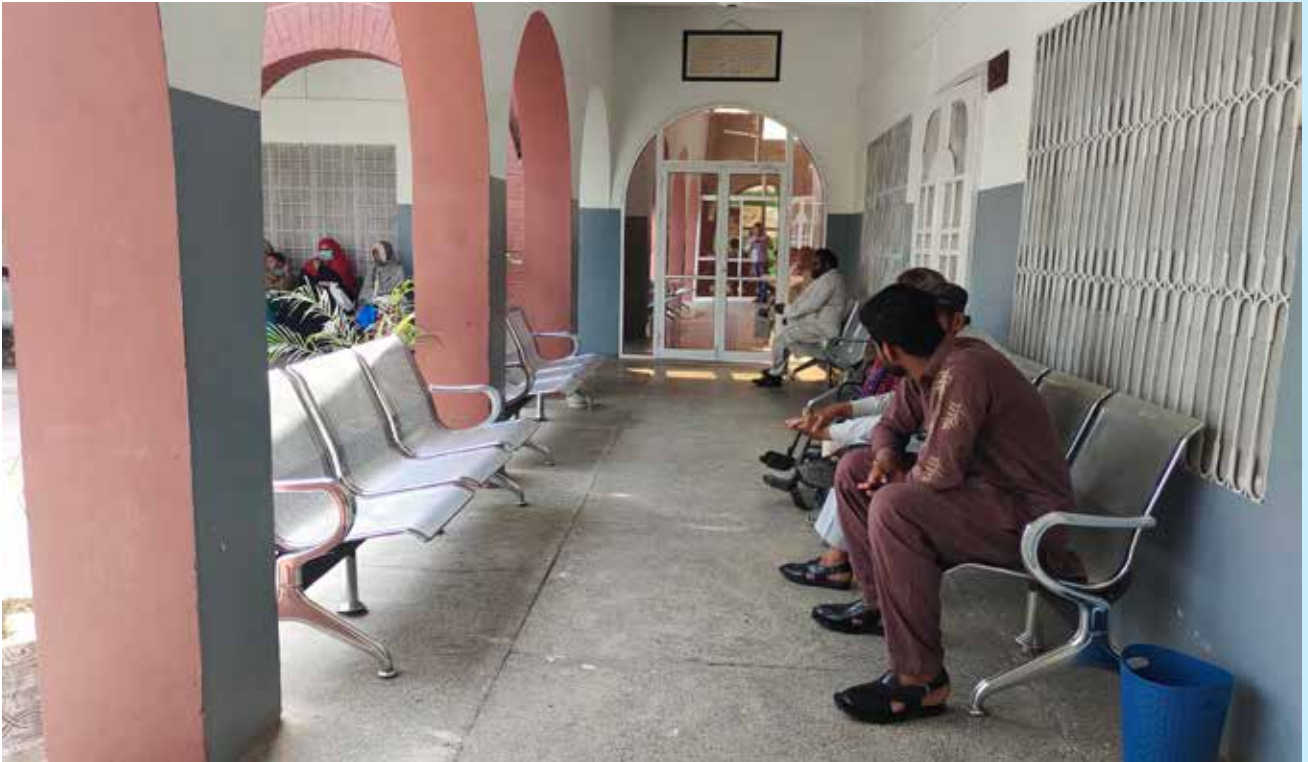
PATIENTS WAITING TO CONSULT THE DOCTOR