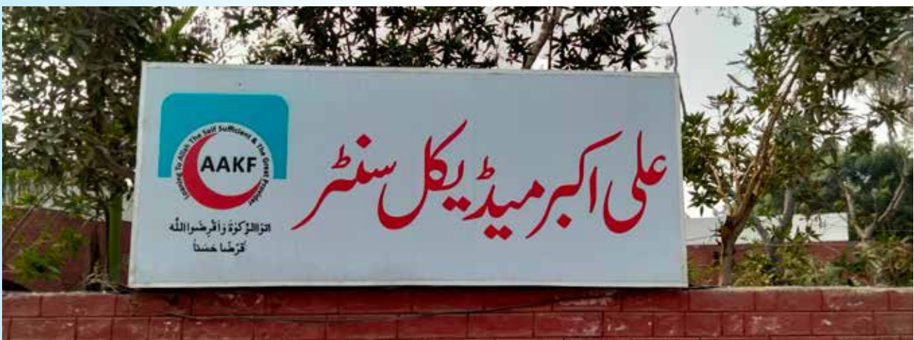
BILLBOARD AT THE ENTRANCE GATE OF THE AAMC