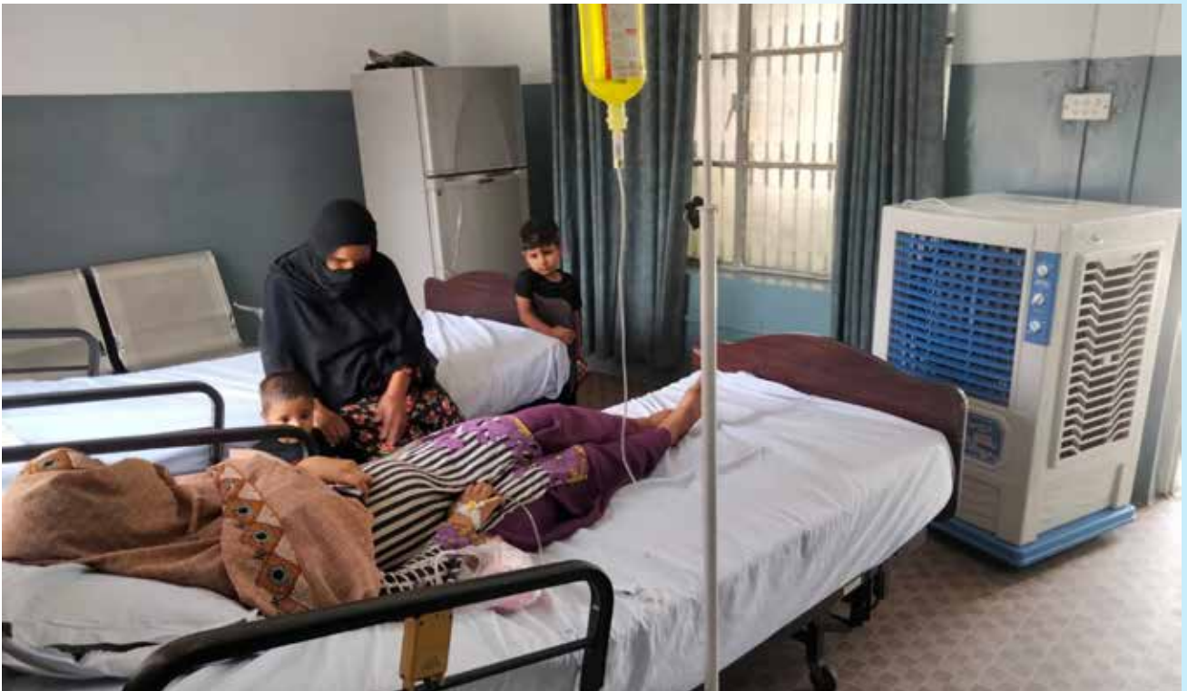
LADY PATIENTS BEING ADMINISTERED DRIP IN THE WARD