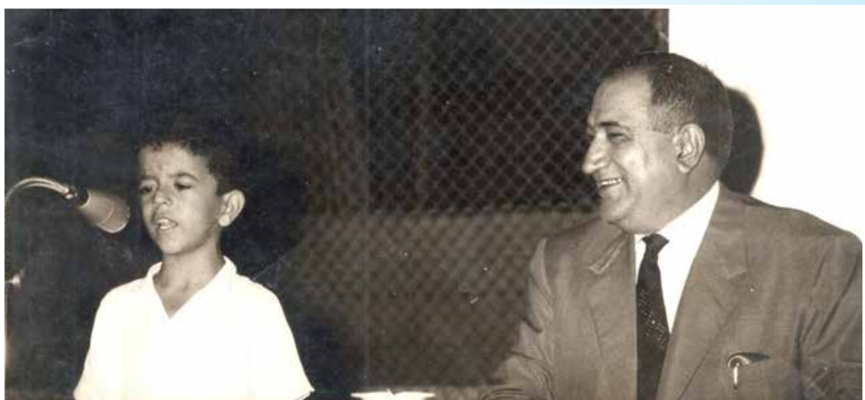
INDEPENDENCE DAY FUNCTION AT THE EMBASSY OF PAKISTAN SCHOOL, JEDDAH (14 AUGUST 1960)